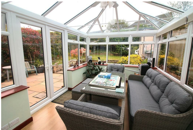
uPVC double glazed conservatory with part built walls, power points, wall mounted electric heater, double glazed doors leading to the rear garden and patio area.