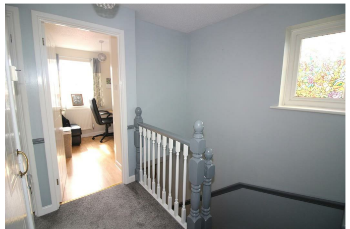
Doorways leading into the first floor living accommodation, double glazed window to the side aspect.