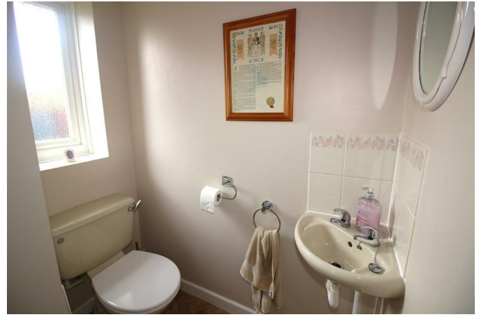
Low level w.c., wash hand basin with tiled splashback, double glazed window to the front aspect.