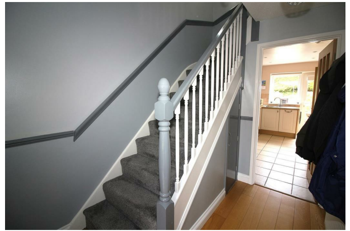
Leading to the first floor landing.